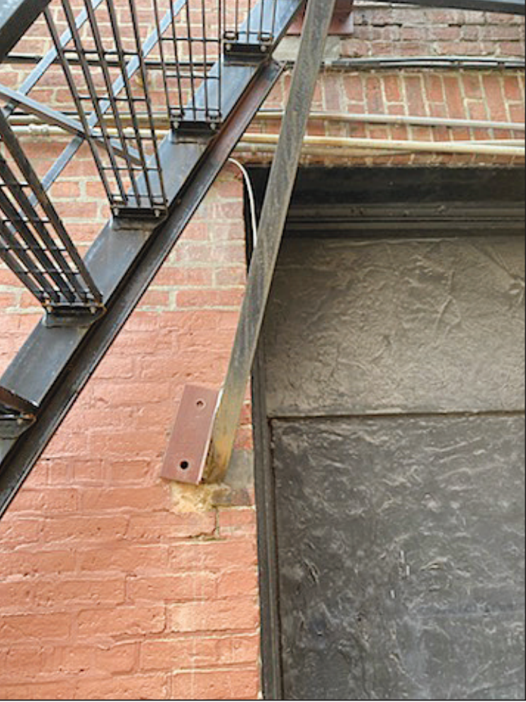
It's often difficult to tell if your fire escape is sufficient with an untrained eye, and inspections are required every five years by qualified individual. The city's Inspectional Services Department doesn't provide this service so homeowners must turn instead to a licensed professional. One such licensed professional is Boston Forging & Welding Corp. - a third-generation family business based in East Boston, with more than 60 years' experience.

To learn more about Boston Forging & Welding Corp, visit bostonforgingandwelding.com; call 617-567-2300 or 617-567-3293; or email info@ bostonforgingandwelding.com.